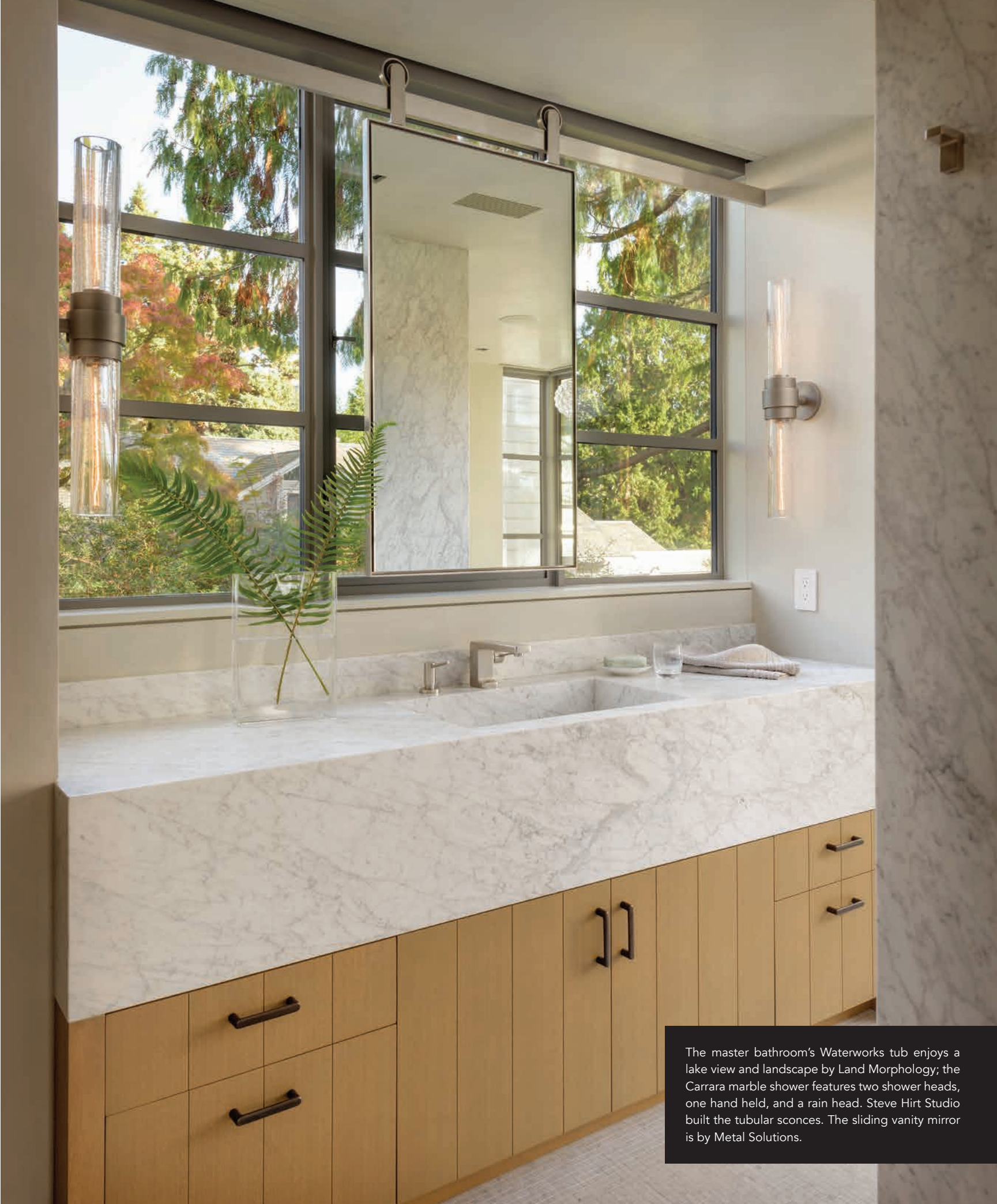
The master bathroom’s Waterworks tub enjoys a lake view and landscape by Land Morphology; the Carrara marble shower features two shower heads, one hand held, and a rain head. Steve Hirt Studio built the tubular sconces. The sliding vanity mirror is by Metal Solutions.